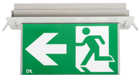
EML-414C / EML-417C