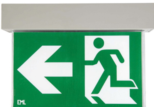
EML-414 / EML-417